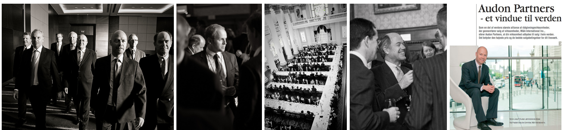
AT THE M&A MID-MARKET FORUM IN LONDON

LASTING MEMORIES Whenever we are facing important moments in life, photography should be part of it. Getting married? You are going to want to relive the moment over and over again. Moving away? Have some pictures taken with family and friends so you can cherish these relationships even when far away. Looking for a new career?